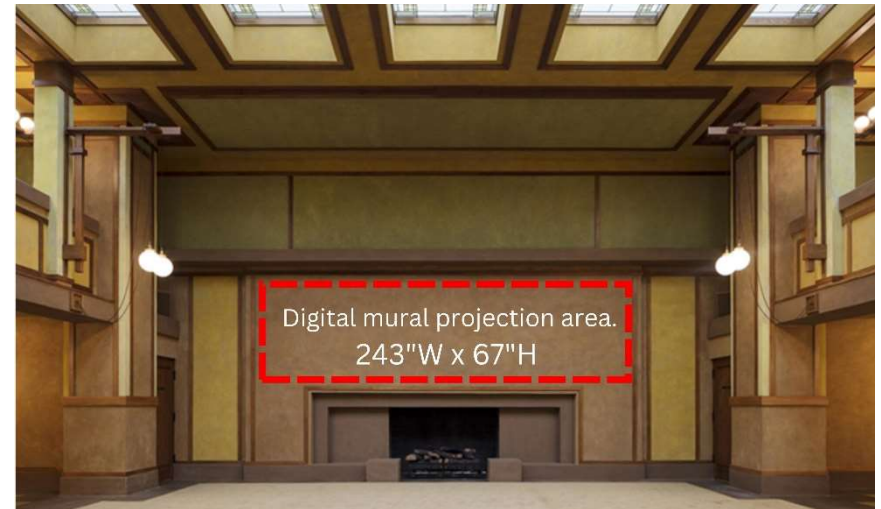
View of fireplace in Unity House